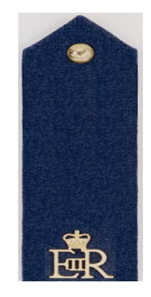
Example shown is ADC

0705. With No 5 SD, sewn in plain shoulder straps in Venetian cloth are worn by officers entitled to wear aiguillettes and/or the Royal Cypher, AVMs and above, DNS (RAF) and those officers assigned to the 1 Star posts of Comdt RAFC Cranwell, Air Officer Wales and Air Officer Scotland