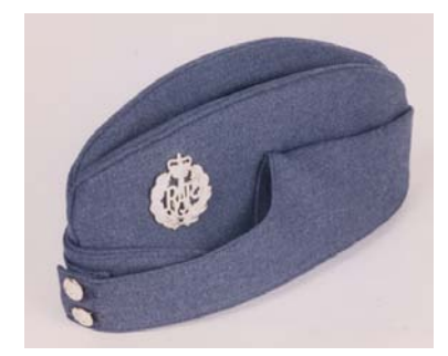
Optional Forage Cap (WO wear this with miniature WO Badge)

Note: RAF Police personnel of the rank of WO and below wear a white-topped No 1 SD Hat when wearing all variations of No 1 or 2 SD uniforms.