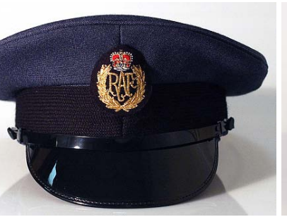
Airmen No 1 SD Hat (See Note )