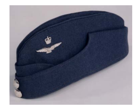
Optional Forage Cap