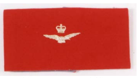
Air Movements Officer