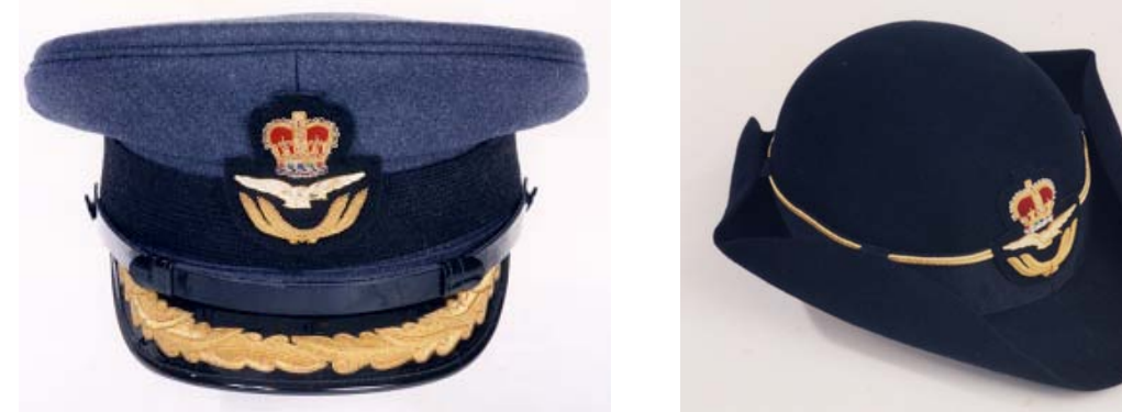
Group Captain (male) No 1 SD Hat Females have same insignia but on Female style SD Hat