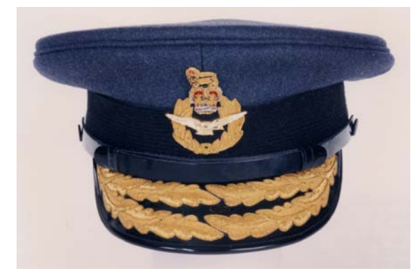
Air Officer (male) No 1 SD Hat Females have same insignia but on Female style SD Hat