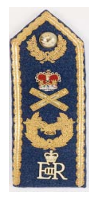
Worn by MRAF on Greatcoat, No1A, 6, 6A, 8 and 8A SD jackets – Example Shown is Air ADC

0703. Ceremonial Shoulder Boards. When in 1A SD, distinctive unranked ceremonial shoulder boards are worn by AVM and above and those officers assigned to the 1 Star posts of Comdt RAFC Cranwell, Air Officer Wales and Air Officer Scotland. When a greatcoat is worn with No 1A or No 5 SD, detachable gold ranked shoulder straps in Crombie material are worn.