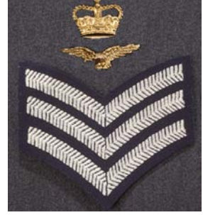
FS Aircrew – No 1 SD