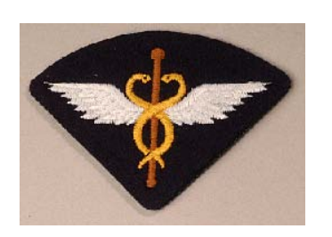
Flight Medical Officer