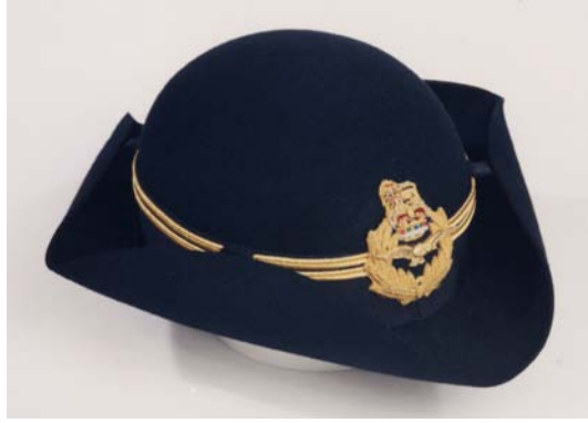
PMRAFNS Female AO