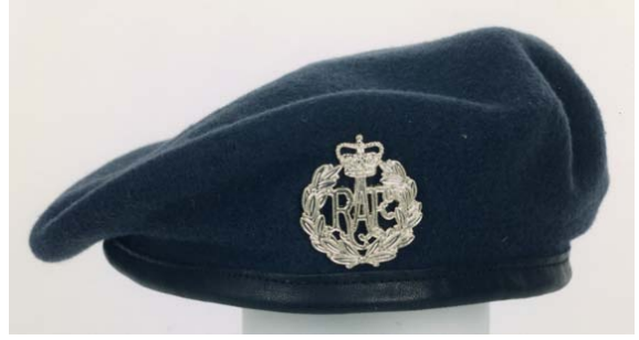
Beret with Airman's Badge (WO wear this with miniature WO Badge)