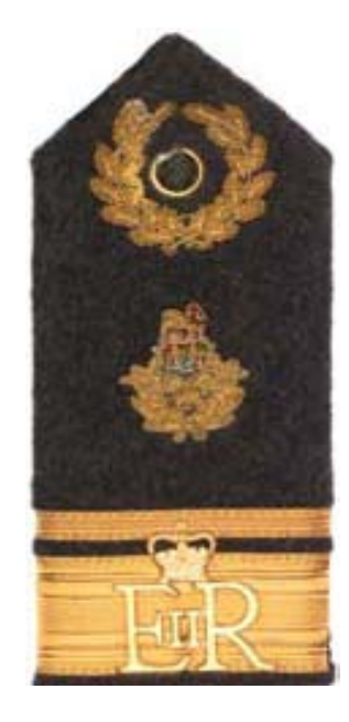
AVM & above (Not MRAF) No 1A SD Ceremonial Shoulder Board (Example shown is ADC)