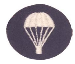
Parachutist Badge without Wings