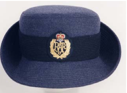
Airwomen No 1 SD (Female WO may wear this with WO Hat Badge)