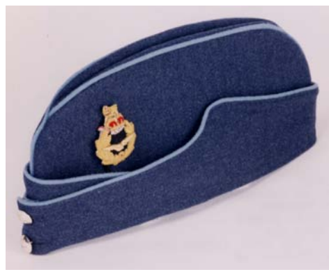
Optional AO Forage Cap