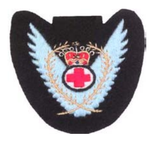
Flight Nursing Officer