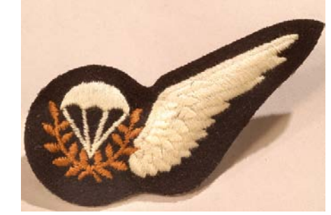
Parachute Jump Instructor